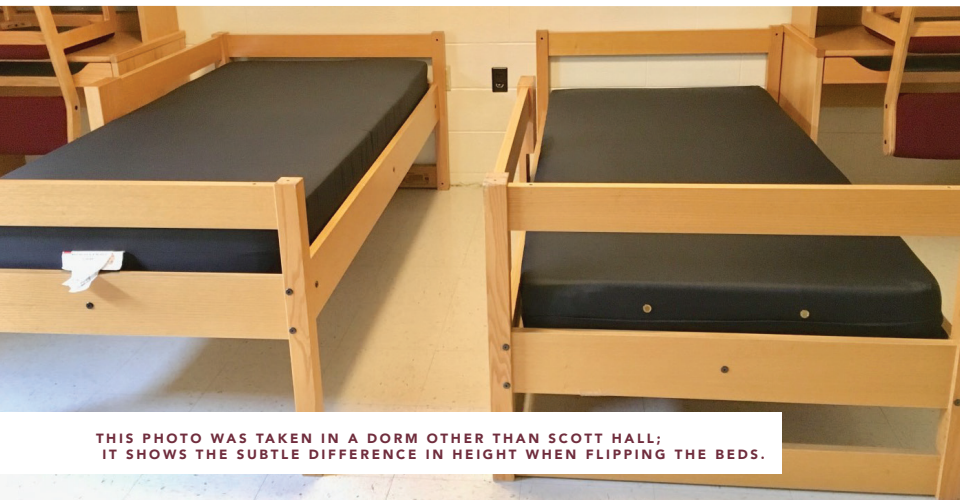
THIS PHOTO WAS TAKEN IN A DORM OTHER THAN SCOTT HALL; IT SHOWS THE SUBTLE DIFFERENCE IN HEIGHT WHEN FLIPPING THE BEDS.